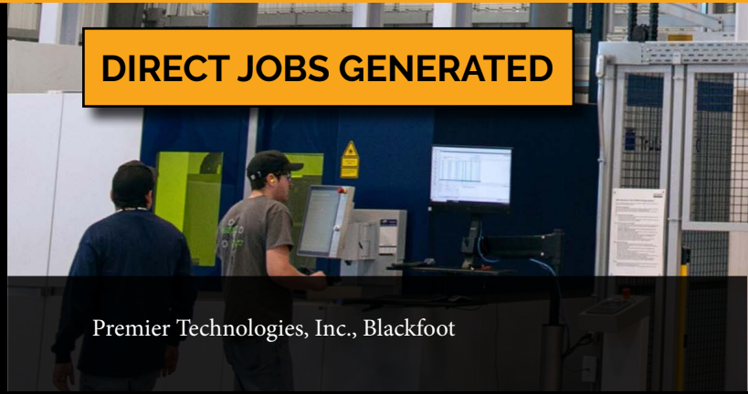
Premier Technologies, Inc., Blackfoot