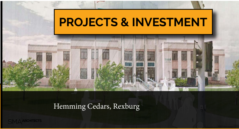
Hemming Cedars, Rexburg