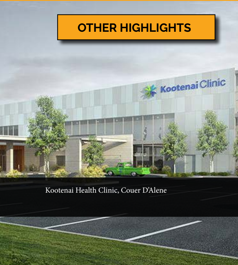
Kootenai Health Clinic, Couer D'Alene