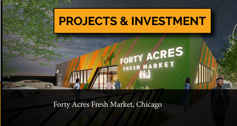
Forty Acres Fresh Market, Chicago