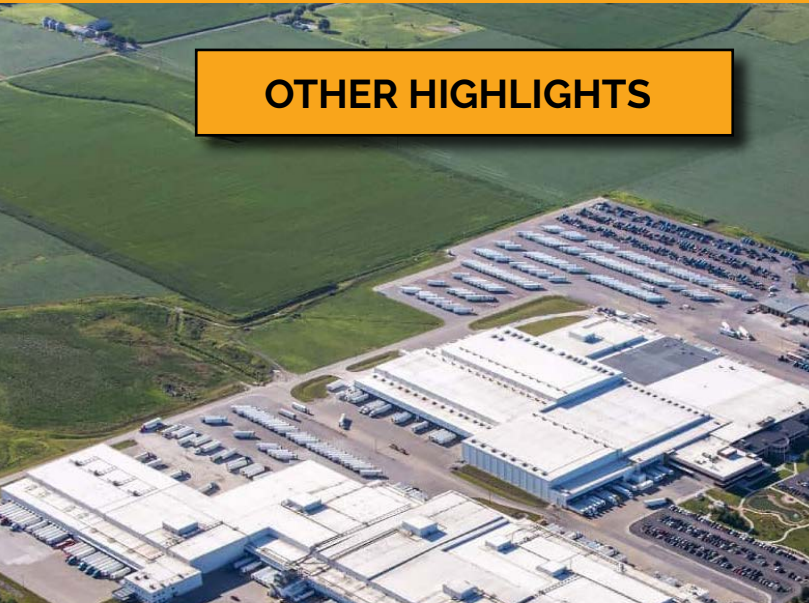
Dot Foods Manufacturing, Mount Sterling