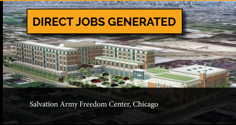
Salvation Army Freedom Center, Chicago