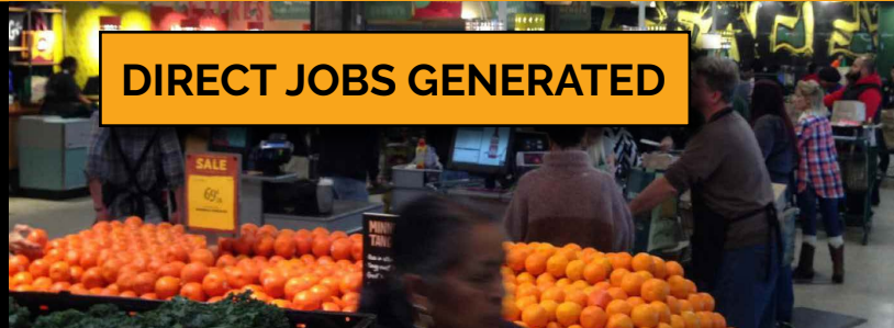
The ReFresh Project, New Orleans