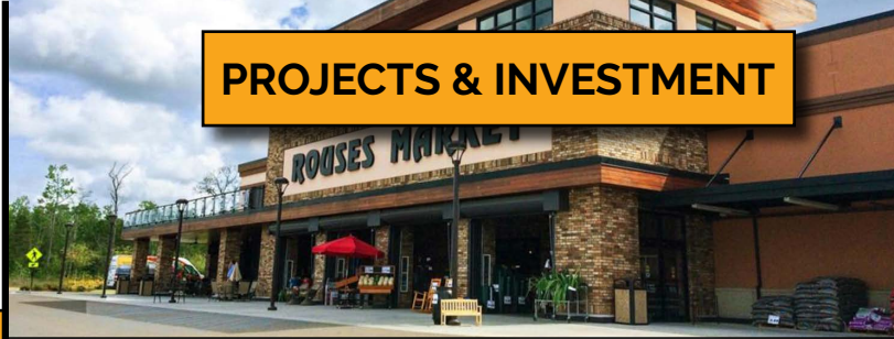
Rouses Market, Jefferson Parish ,LA