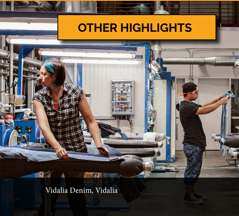
Vidalia Denim, Vidalia