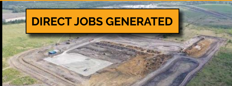
Audubon Metals, Corsicana