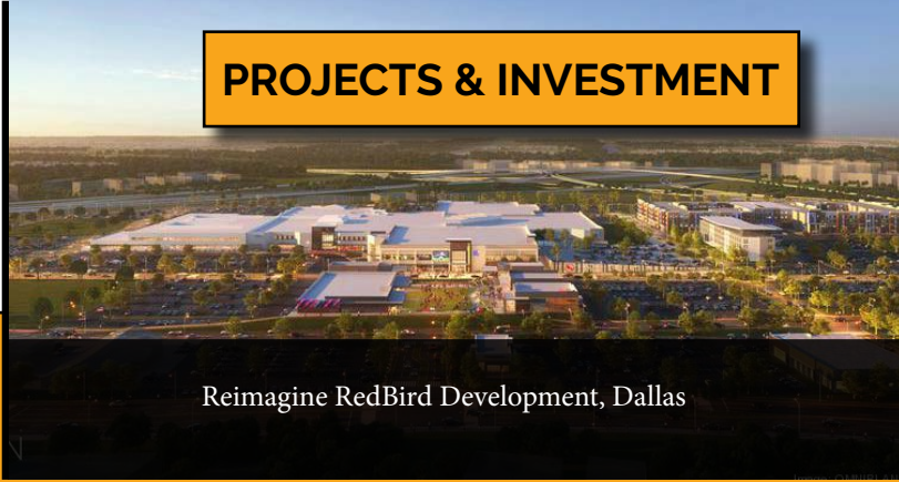
Reimagine RedBird Development, Dallas