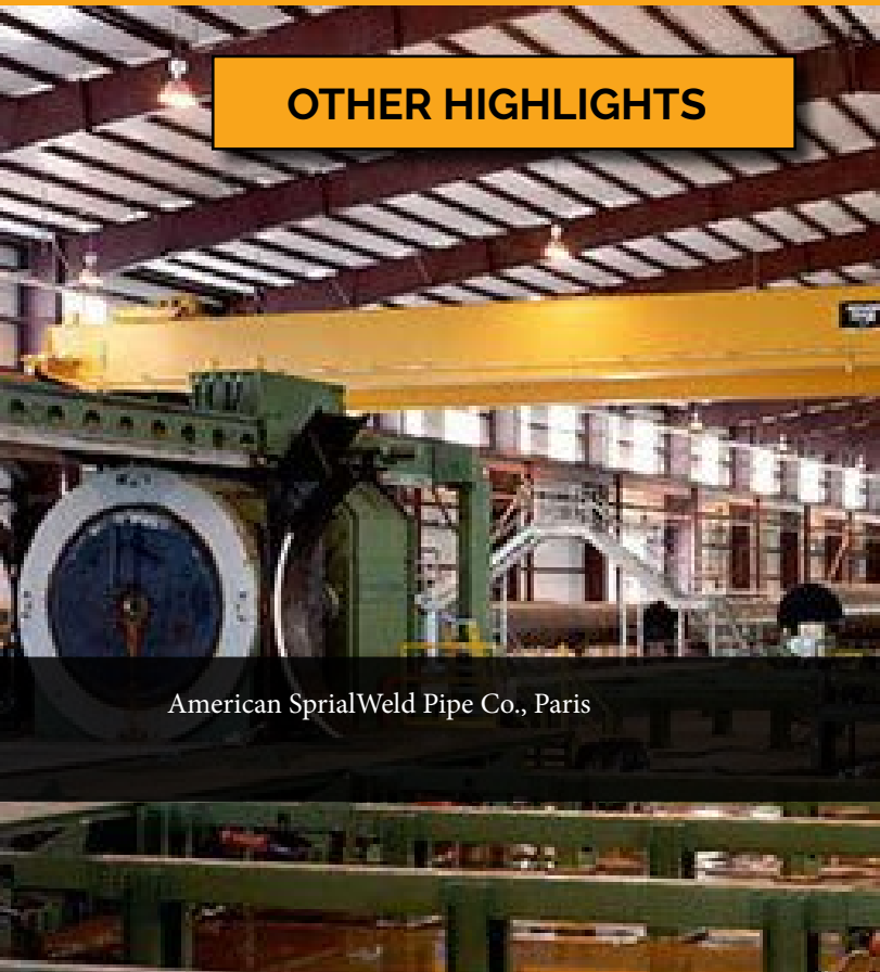
American SprialWeld Pipe Co., Paris